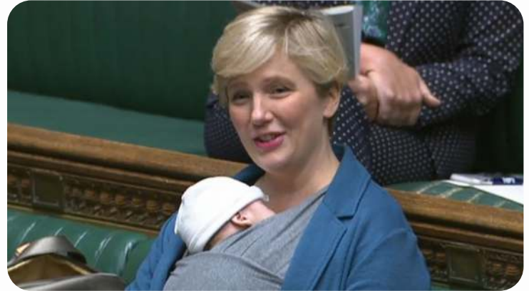
Stella Creasy in parliament